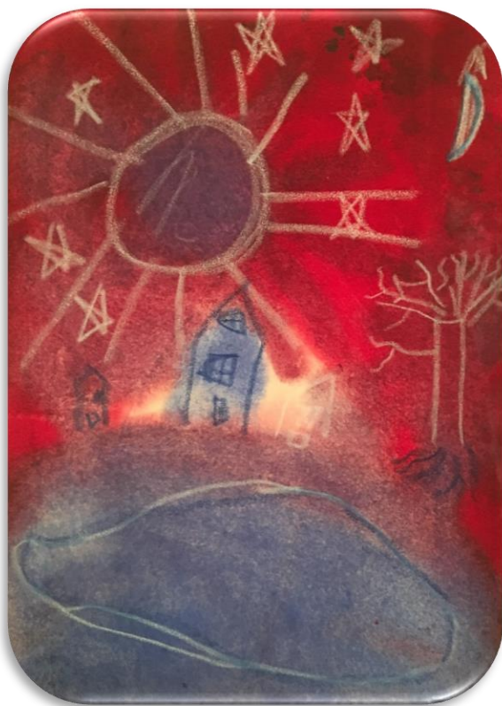
Dawn and dusk by a Class 2 pupil

Time is not measured by the years that you live But by the deeds that you do and the joy that you give- And each day as it comes brings a chance to each one To love to the fullest, leaving nothing undone That would brighten the life or lighten the load Of some weary traveler lost on Life's Road- So what does it matter how long we may live If as long as we live we unselfishly give."