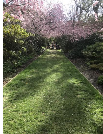
Playgroup Spring Festival visits the cherry walk