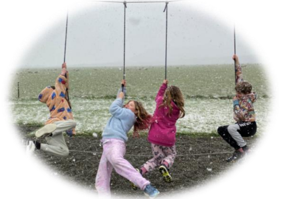
Class Kea - Camp action