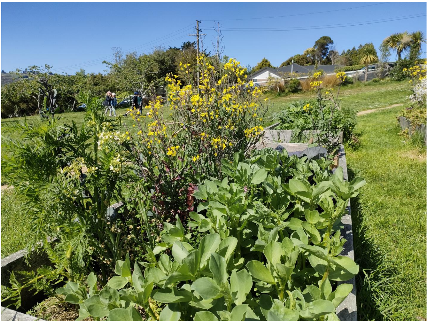
Thriving garden bed from Class Kākāpō

Proprietors Trust Chair – proprietors@dunedinsteiner.nz