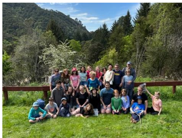
Class Kererū on camp

With your food basket and my food basket the people will thrive