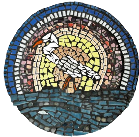
Class kea pupil's mosaic

Fruits are now ripe, and man eats the new food of the season