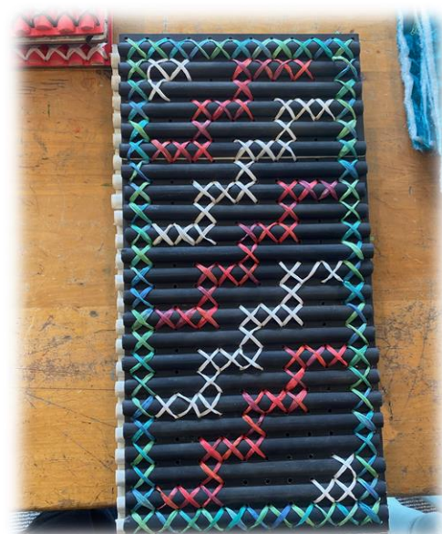
Handwork: tukutuku panels- class Kea