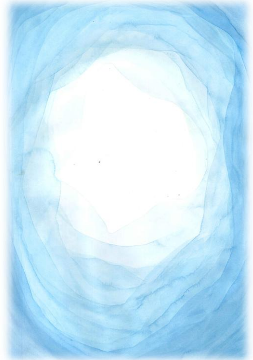
Veil painting created in last night's workshop