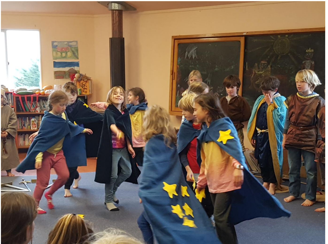
HARVEST FESTIVAL 2019