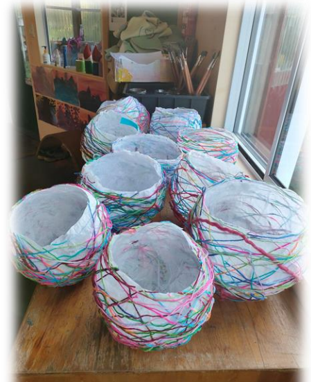
Class Kākāpō lanterns